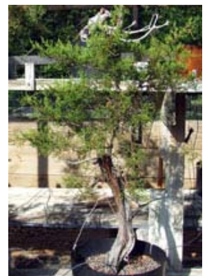
Number 7 also collected by Bill Cody.