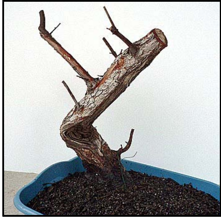
CEDAR ELM, CASCADE OR MOYOGI?